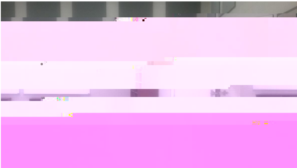
Band Room and related classrooms have been prepared as specified. As architectural sound batts for balance have in installed as specified